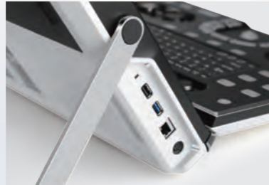
Multi-functional handle for quick stand when needed