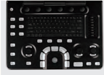
Physical keyboard for fast information input