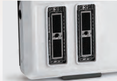
Two probe ports